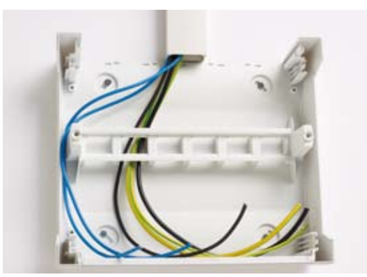
Optimum wiring space