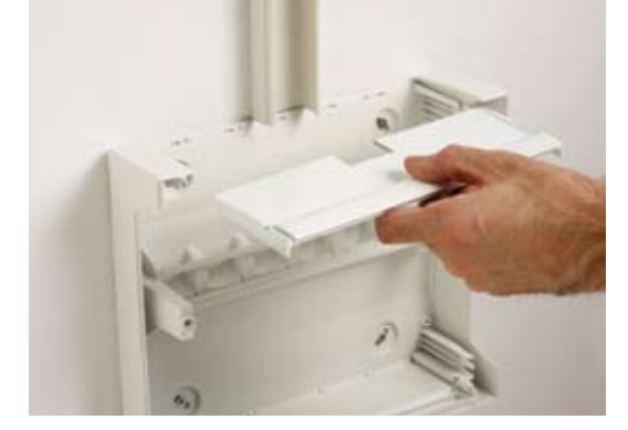
Two removable plates to create more space for the connection work (surface-mounted version)