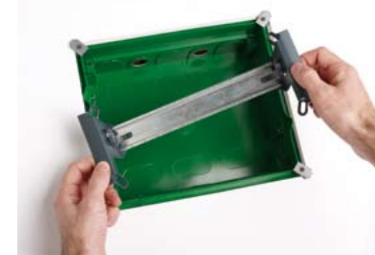
Removable chassis for table-top installation, as well as the possibility of adjustment for correct horizontal and vertical positioning (flush-mounted version)