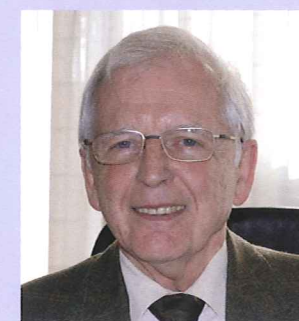
Professor Harald zur Hausen is the winner of the 2008 Nobel Prize for Medicine for discovering human papillomaviruses that cause cervical cancer. Former Scientific Director, Deutsches Krebsforschungszentrum (DKFZ; German Cancer Research Center) from 1983 to 2003