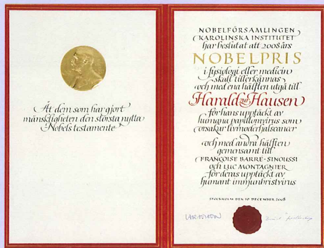
Professor Harald zur Hausen