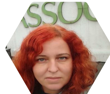
PR & Communications assistant