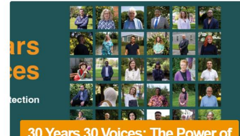
30 Years 30 Voices: The Power of Protection