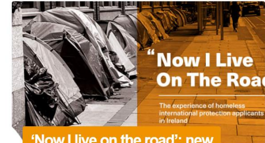
'Now I live on the road': new report on homelessness among people seeking protection