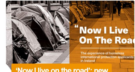
'Now I live on the road': new report on homelessness among people seeking protection