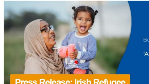
Press Release: Irish Refugee Council budget submission calls for Child Benefit or equivalent payment

The Irish Refugee Council provide services and support for people seeking protection and people recognised as refugees in Ireland and advocate for humane and dignified protection procedures and responses to people fleeing persecution.