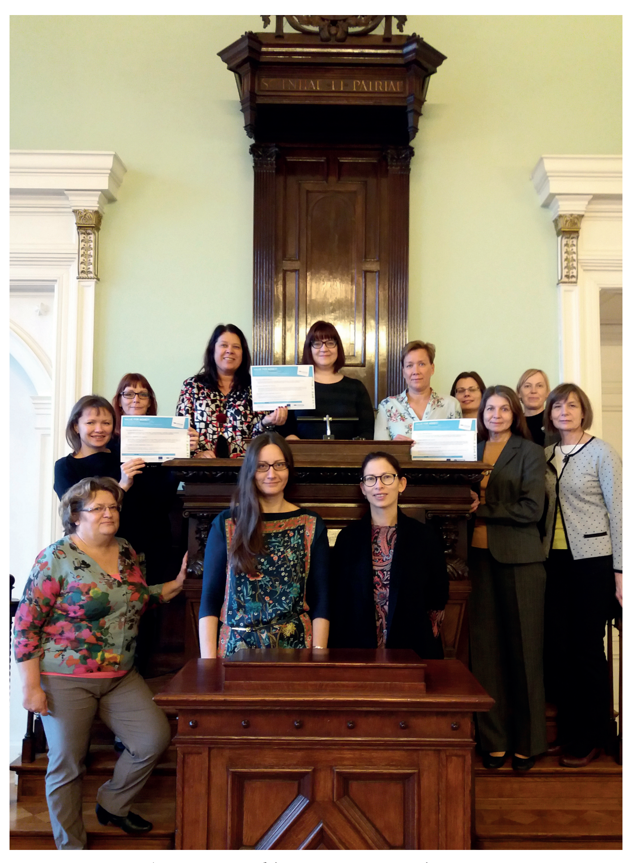
Picture 1. The representatives of the partner universities in the project BOOSTED