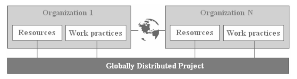
Fig. 2. Inter-organizational globally distributed projects