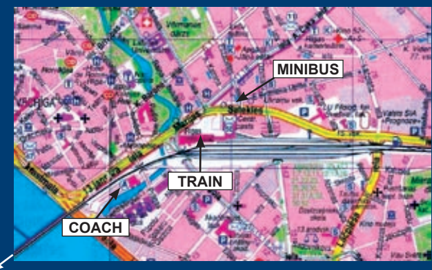
Jūrmala Riga Central Coach, Minibus and Railway Station

Distance from Hotel " Baltic Beach Hotel " (http://www.jurmalatour. Iv/en/accommod.htm#Daina) to the centre of Riga – 30 kilometres: transport – train in the direction Jurmala to *Majori* station, or minibuses. Distance to Riga airport – 20 kilometres: transport – taxi to Jūrmala or public transport to Riga combined with train.